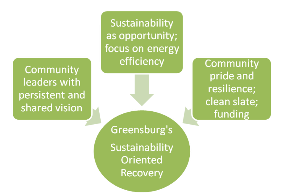
Figure 5. Explaining Greensburg's Sustainability Innovations.

Similarly, the dominant focus on energy efficiency in the sustainability effort, at least as presented in the newspaper coverage analyzed here, may suggest that this approach is particularly compatible with existing concerns and interests in Greensburg. Rebuilding with energy conservation as a focus responds to a pressing worry shared by most Greensburg citizens—that they can afford the cost of a new home. Though newspaper accounts of the recovery process portray energy efficiency, conservation, and renewable sources as "green" and "environmentally-friendly", the heart of the matter may be that these approaches yield economic benefits that will help Greensburg and its citizens. This again supports Tornatzky and Klein's [17] finding that innovative approaches that are compatible with existing practices and/or values are more likely to be adopted. While there are many additional aspects of the sustainability initiative outlined in the recovery plan and comprehensive plan, it remains to be seen whether these will capture as much interest as the energy efficiency aspects.