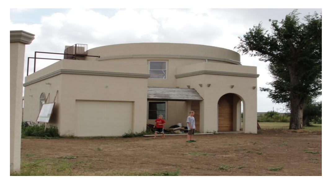
Figure 2. The Greensburg Eco Silo Home (photo by the author, September 2009).

Further progress towards the recovery plan's recommendations is evident in the May 2008 "Greensburg Sustainable Comprehensive Plan" developed with the assistance of consultants. Again, sustainability is a common thread throughout this document, which includes not only the typical comprehensive plan sections on land use, housing, transportation, and economic development, but also sections on walkability, energy, and carbon. In its introductory section on vision and goals, the plan suggests that sustainability is in fact a value long-cherished value among citizens of Greensburg and throughout the state: "The root of sustainability is based in common Kansas values. A Kansan thinks in terms of generations and harbors a sincere belief that decisions should build strong communities for our children. … We understand the natural systems that power a sustainable economy and know what it means to live off, and with, the land" [6].