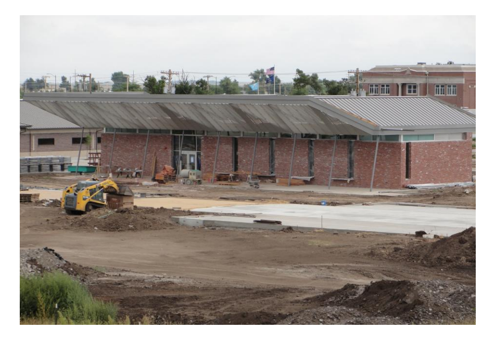
Figure 3. Greensburg's Nearly-completed LEED Platinum City Hall (photo by the author, September 2009).

The story of Greensburg's sustainability-oriented rebuilding effort is still unfolding. While undoubtedly there are disagreements as to the pace and particulars of this effort, the sustainability focus has been maintained, even through the 2008 election cycle which ushered in a new mayor and new city council members. What remains, then, is to understand further the forces that have prompted and supported this move towards sustainability. Understanding more about how innovation arises and diffuses at the local government level is helpful not only to explaining the story of Greensburg itself but also its potential applicability as a model to other rural and/or small communities. As the future sustainability of such communities hinges on the adoption of new approaches, it is essential to begin to identify conditions that both facilitate and hinder local innovation.